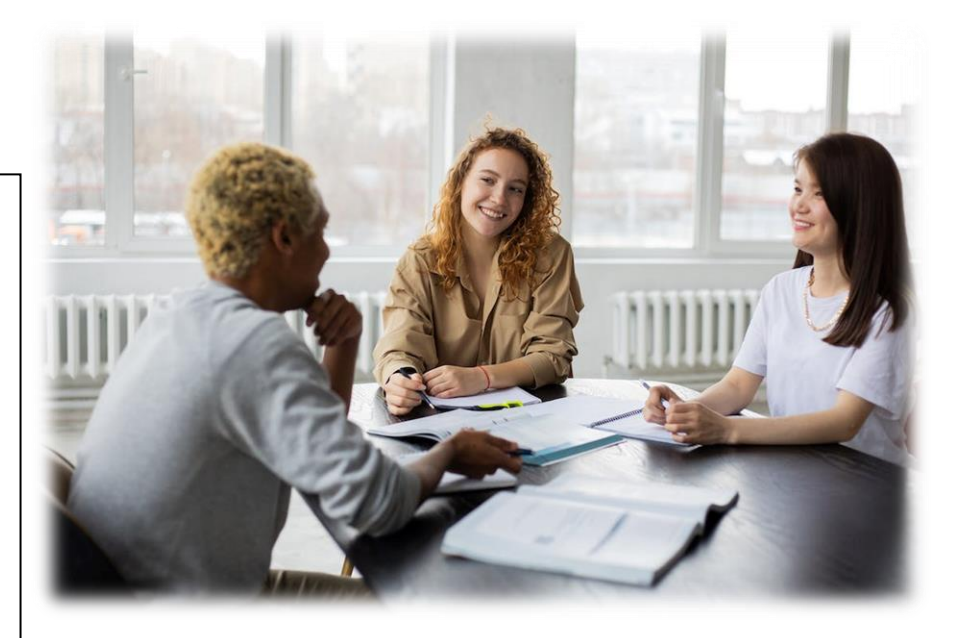
Image of three people sitting at a table talking

Teaching and Learning at Trent has a repository of information about <u>Artificial Intelligence in</u> <u>Higher Education</u> and the knowledgeable staff at the Centre for Teaching & Learning and Trent Online are always available for consultation!